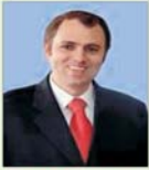
Shri Omar Abdullah Hon'ble Chief Minister J&K State