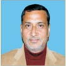
Shri Sham Lal Sharma Hon'ble Health Minister J&K State